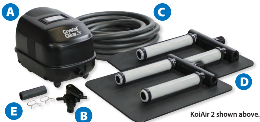
KoiAir 2 shown above.