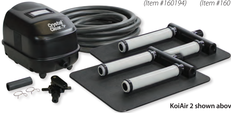
KoiAir 2 shown above.